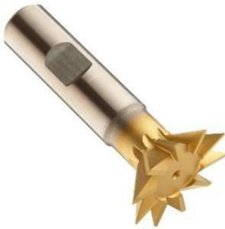
Dove Tail Cutter