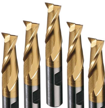
Slot Drill Cutter