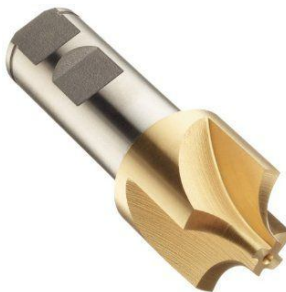
Corner Rounding Cutter