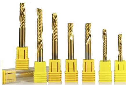
Single Flute Endmill