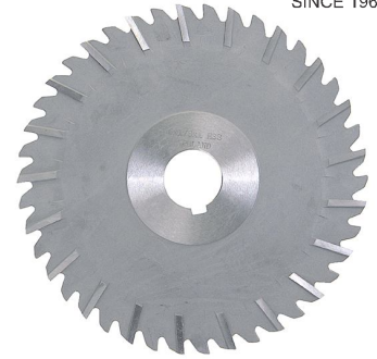
Staggered Teeth SCCS