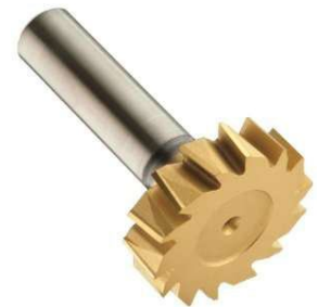
Wood Ruff Cutter