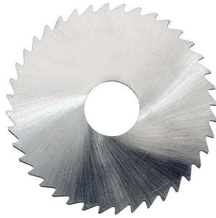
Slitting Saw Ground Teeth